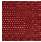
L4540_LOME_ C525_C526_FE _Verso