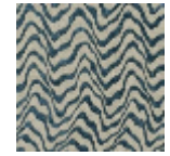
L4541_KENYA_ C534_FM_VER SO