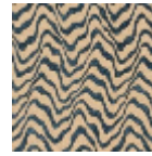
L4541_KENYA_ C534_FB_VER SO