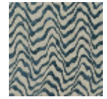
L4541_KENYA_ C534_FM_VER SO