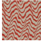
L4541_KENYA_ N3176_FM_VE RSO