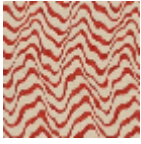
L4541_KENYA_ N3176_FG_VER SO