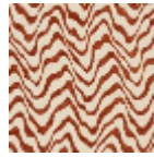
L4541_KENYA_ C517_FE_VERS O