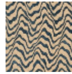
L4541_KENYA_ C534_FB_VER SO