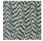
L4541_KENYA_ C534_FM_VER SO