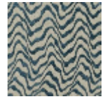
L4541_KENYA_ C534_FM_VER SO