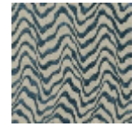
L4541_KENYA_ C534_FM_VER SO