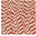
L4541_KENYA_ N3176_FG_VER SO