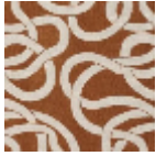
L4543_LES_RU BANS_N3013_F E_Verso