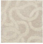
L4543_LES_RU BANS_C501_FE _Verso