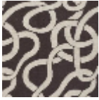
L4543_LES_RU BANS_B72_FE _Verso