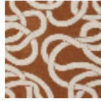
L4543_LES_RU BANS_N3013_F E_Verso