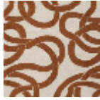
L4543_LES_RU BANS_N3013_F E