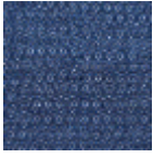
L4546_INGRID _N3019_B38_N 3019_B38