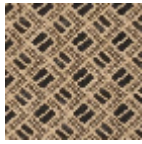
L4550_TASSILI _B54_FB_VERS O