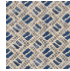
L4550_TASSILI _N3121_FE_VER SO