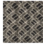
L4550_TASSILI _C508_FE_VER SO