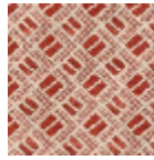
L4550_TASSILI _B92_B13_FE_ VERSO