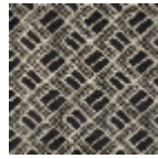
L4550_TASSILI _C508_FE_VER SO