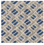
L4550_TASSILI _N3121_FE_VER SO