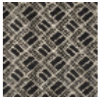
L4550_TASSILI _C508_FE_VER SO