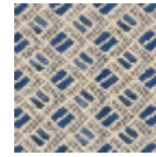
L4550_TASSILI _N3121_FE_VER SO