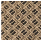
L4550_TASSILI _B54_FB_VERS O