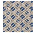
L4550_TASSILI _N3121_FE_VER SO