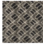
L4550_TASSILI _C508_FE_VER SO