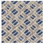
L4550_TASSILI _N3121_FE_VER SO