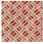
L4550_TASSILI _B92_B13_FE_ VERSO