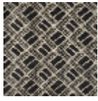
L4550_TASSILI _C508_FE_VER SO