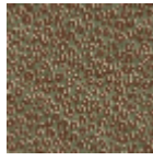
L4570005 Vert d'eau