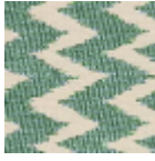
L5001_SULLY_ N3135_N3149_F E