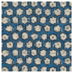
L5002_YAOUN DE_B54_B21_F E