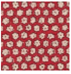
L5002_YAOUN DE_B13_B02_F E