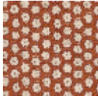
L5002_YAOUN DE_N3024_N3 013_FE