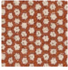
L5002_YAOUN DE_N3024_N3 013_FE