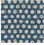
L5002_YAOUN DE_B54_B21_F E