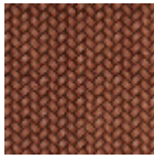
L5003_TRESSA GE_C509_C517 _FM