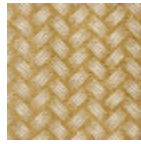
L5003_TRESSA GE_C515_N300 4_FE