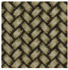
L5003_TRESSA GE_C508_N314 4_FM