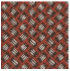
L5003_TRESSA GE_B92_B84_ B54_B68_FE