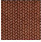
L5003_TRESSA GE_C509_C517 _FM