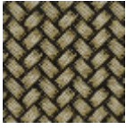
L5003_TRESSA GE_C508_N314 4_FM