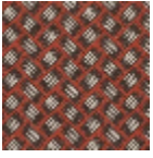
L5003_TRESSA GE_B92_B84_ B54_B68_FE