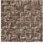
L5004_CONG O_C507_C512_ FM