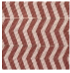
L5006_BOMA_ N3024_N3022_ FE