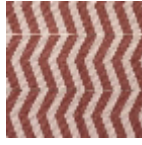
L5006_BOMA_ N3024_N3022_ FE