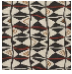
L5007_BENIN_ B54_B57_N317 6_FE