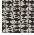
L5007_BENIN_ N3011_N3002_ N3159_FE