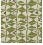
L5007_BENIN_ B23_B14_B76_ FE