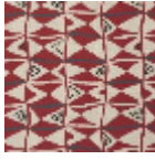
L5007_BENIN_ B84_B54_B65_ FE