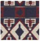
L5008_BURKI NA_B13_B38_F E