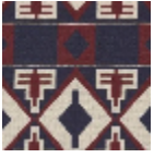
L5008_BURKI NA_B13_B38_F E