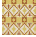
L5008_BURKI NA_N3013_N30 17_FE