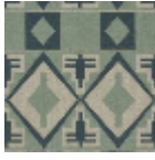
L5008_BURKI NA_B65_B31_F M