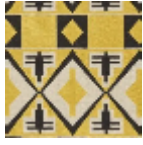
L5008_BURKI NA_B54_N3010 _FE