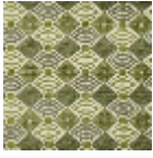
L5009_FANIO N_C539_C541_ FE