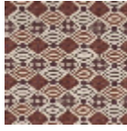
L5009_FANIO N_N3179_N301 2_FE