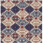
L5009_FANIO N_B38_N3024_ FE