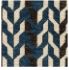
L5010_DAKAR_ C533_C534_C51 O_C508_FE