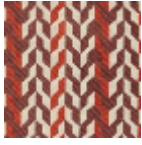
L5010_DAKAR_ N3024_N3015_ FE