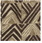
L5011_TACHAD _C510_C507_F G