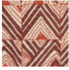
L5011_TCHAD_ N3015_N3024_ FE