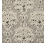
L5014_AUBIGN Y_N3003_B69_ FE