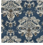
L5014_AUBIGN Y_C533_C534_ C510_C508_FE