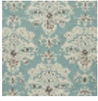
L5014_AUBIGN Y_B30_B73_B7 1_B69_FE