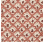
L5018_GOYA_ N3104_N3024_ FE