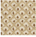
L5018_GOYA_ N3004_B28_F E