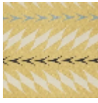
L5019_FIORI_N 3016_N3139_N3 002_FE