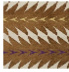
L5019_FIORI_N 3020_C512_N31 39_FE