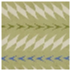
L5019_FIORI_C 532_C543_C53 9_FE