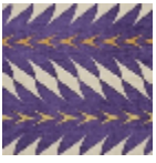
L5019_FIORI_B 32_C528_B58_ FE