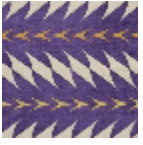
L5019_FIORI_B 32_C528_B58_ FE