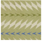
L5019_FIORI_C 532_C543_C53 9_FE