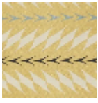
L5019_FIORI_N 3016_N3139_N3 002_FE