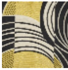
L5020_REBON DS_B54_N3010 _FE