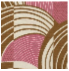
L5020_REBON DS_B28_B16_F E