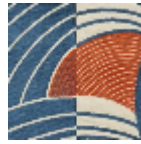
L5020_REBON DS_C533_N301 5_FE