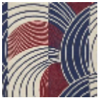
L5020_REBON DS_B38_N3025 _FE