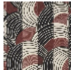
L5020_REBON DS_B54_N302 4_FE