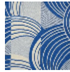
L5020_REBON DS_N3019_N31 26_FE