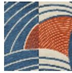
L5020_REBON DS_C533_N301 5_FE