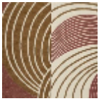
L5020_REBON DS_N3021_N30 24_FE