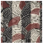
L5020_REBON DS_B54_N302 4_FE