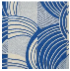
L5020_REBON DS_N3019_N31 26_FE