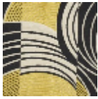
L5020_REBON DS_B54_N3010 _FE