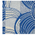
L5020_REBON DS_N3019_N31 26_FE