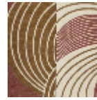
L5020_REBON DS_N3021_N30 24_FE