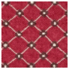
L5023_LOUISE _N3100_N3014 _FE