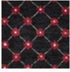
L5023_LOUISE _C527_C508_F E