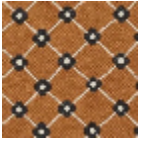
L5023_LOUISE _B54_N3013_F E