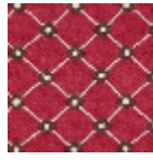
L5023_LOUISE _N3100_N3014 _FE