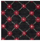
L5023_LOUISE _C527_C508_F E