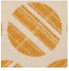
L5024_GRAND _TOKYO_B58_ _FE