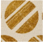
L5024_GRAND _TOKYO_C515_ _C516_FE