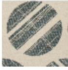
L5024_GRAND _TOKYO_N3137 _FE