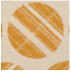
L5024_GRAND _TOKYO_B58_ _FE