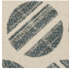
L5024_GRAND _TOKYO_N3137 _FE