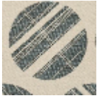
L5024_GRAND _TOKYO_N3137 _FE