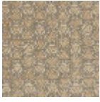
L5025_ISFAHA N_C504_B71_F G