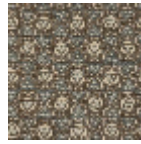
L5025_ISFAHA N_N3137_N315 9_FG