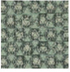
L5025_ISFAHA N_B73_B91_B6 5_B54_FA