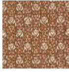
L5025_ISFAHA N_N3013_N302 1_FE