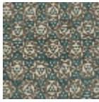
L5025_ISFAHA N_C535_N3158 _FE