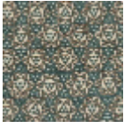
L5025_ISFAHA N_C535_N3158 _FE