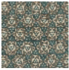
L5025_ISFAHA N_C535_N3158 _FE