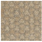
L5025_ISFAHA N_C504_B71_F G