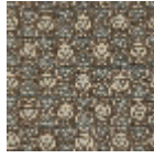
L5025_ISFAHA N_N3137_N315 9_FG