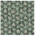
L5025_ISFAHA N_B73_B91_B6 5_B54_FA