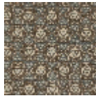
L5025_ISFAHA N_N3137_N315 9_FG