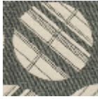
L5027_GRAND _TOKYO_NEGA TIF_N3137_FE