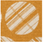
L5027_GRAND _TOKYO_NEGA TIF_B58_FE