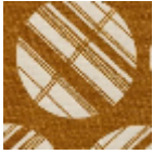
L5027_GRAND _TOKYO_NEGA TIF_C515_C516_ FE