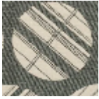
L5027_GRAND _TOKYO_NEGA TIF_N3137_FE