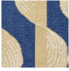
L5028_OSAKA _N3121_N3004_ FE