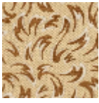
L5029_NARA_ N3004_C512_F E