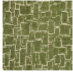
L5031_FALBAL A_C539_C541_ FG