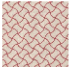
L5032_NAIADE _B16_B17_FE_V ERSO