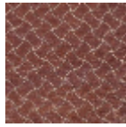
L5032_NAIADE _C517_C529_F M