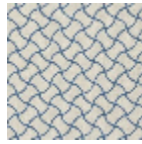
L5032_NAIADE _B21_FE_VERS O