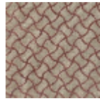
L5032_NAIADE _C517_C529_F M_VERSO