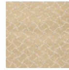
L5032_NAIADE _N3183_FB_VE RSO