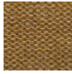
L5034_MOISS ON_C510_C516 _FM_VERSO