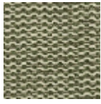
L5034_MOISS ON_B23_B54_ FE_VERSO