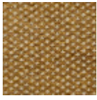
L5034_MOISS ON_C510_C516 _FM