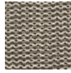
L5034_MOISS ON_N3002_FE _VERSO